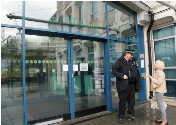
Exeter Civic Centre, where the Heavitree Road neighbourhood team will be relocated in 2018