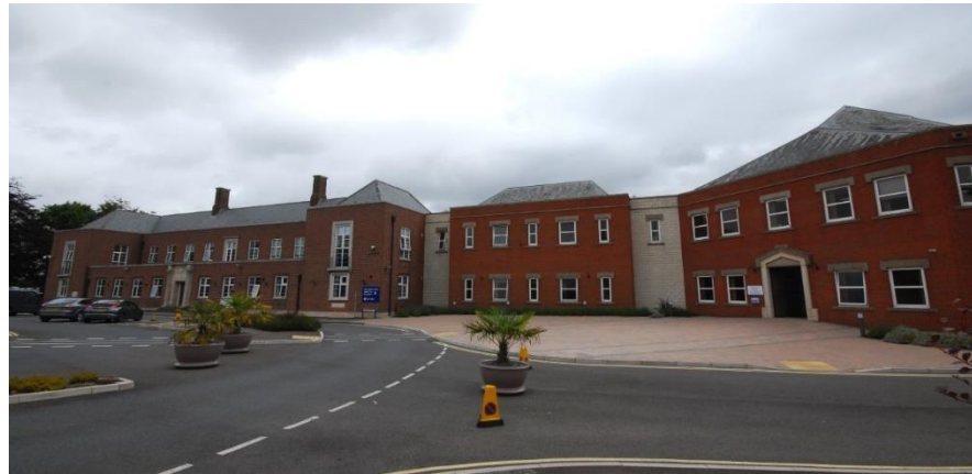
Headquarters main entrance, Middlemoor, Exeter