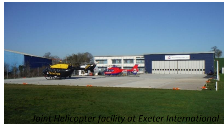
Joint Helicopter facility at Exeter International Airport

All of our communications emphasise that redeveloping redundant estate will enable reinvestment in policing, improvements to the existing estate and no reduction in service provision.