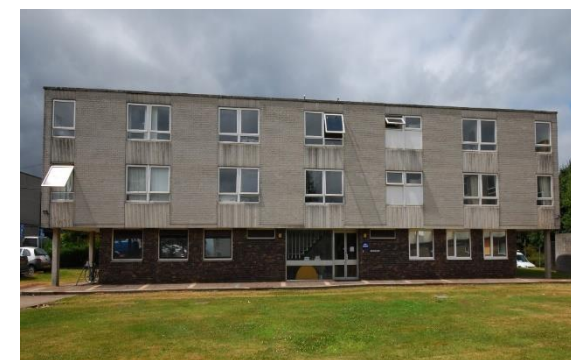
Plymouth House (Residential Plot A) at Middlemoor, Exeter, which is on land to be redeveloped for reinvestment examples of reducing demand on the estate

All opportunities will be explored with a view to optimising revenue. Long term leases of large premises will continue to be avoided, ensuring value for money and flexibility in our estate. Public sector partnership initiatives remain the preferred model for medium term requirements such as neighbourhood team bases or community hubs, whilst specialist functions will remain in our own bespoke freehold premises.