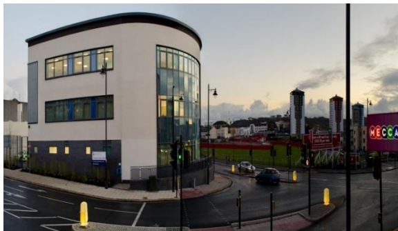
Devonport Police Station, constructed to BREEAM Very Good

We are committed to a reducing carbon footprint. Having achieved a reduction of 19.5% between 2011 and 2015, the objective is to reduce carbon by a further 10% by 2021. We aspire to construct all new buildings to the Building Research Establishment Environmental Assessment Model (BREEAM) "Very Good" as standard.