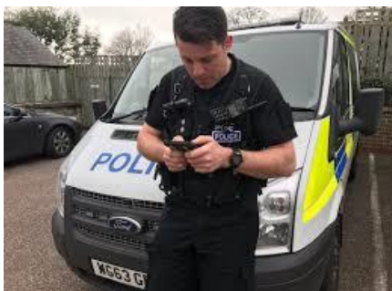
An officer using mobile data to view crime logs

We will look at building adaptations to make best use of our existing space and support the growth in officer numbers across local policing and criminal investigation teams. An example of this is the investment in Exmouth Police Station to accommodate the Modern Slavery Unit and our previously delivered Air Support Facility housing the National Police Air Service (NPAS) and the Devon Air Ambulance Trust (DAAT).