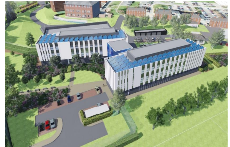
Artist's impression of the new Custody Hub and offices at Middlemoor, Exeter, due for delivery in December 2019

4. Alongside operational teams we will assess the ageing custody estate, to build a pipeline of custody replacement schemes combined with operating hubs at key locations.